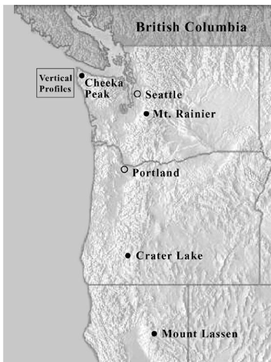
Fig. 1. Map showing the US west coast and sampling sites.

The aerosol index (AI) data from the TOMS instrument onboard the Nimbus 7 satellite showed large values over China for much of the month of April 1993. The AI values were especially high in the later part of the month over both western and eastern portions of China. The AI images also suggest that some of this aerosol was